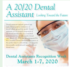
DARW—March 1 to 7, 2020