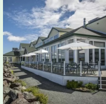
AGM at the Rodd Inn on May 23, 2020