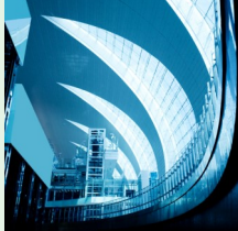
Scholarship for children of NBDAA members