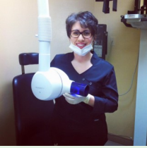
2020 Salary Guide for dental assistants in NB